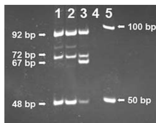
FIGURE 3. Polyacrylamide gel electrophoresis showing DNA stained with ethidium bromide visualized with ultraviolet light. Lanes 1 and 2 contain duplicate samples of the DNA extracted from the brain sample amplified as described in the text and digested with Hha to reveal the restriction fragment length polymorphism. Lane 3 is a sample known to be E2/E4 prepared in parallel with the samples from Lanes 1 and 2. Lane 4 is a negative template control. Lane 5 contains a 50 to 2000 basepair ladder.

Our case represents a retired professional player (who played a total of 14 yr of organized football) who had developed a progressive major depressive disorder after retirement from football, accompanied by repeated suicide attempts and a completed suicide by ingestion of ethylene glycol. Autopsy confirmed the presence of abnormal metabolism and widespread neuronal and neuropil accumulation of a cytoskeletal protein to form NFTs and